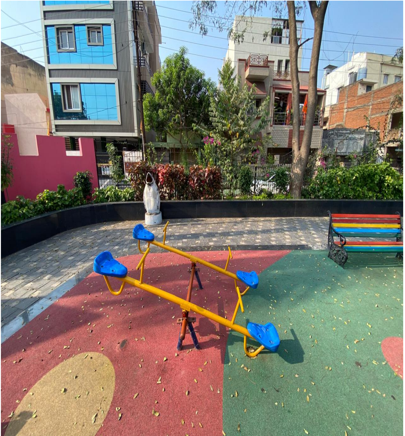
See Saw Double Board