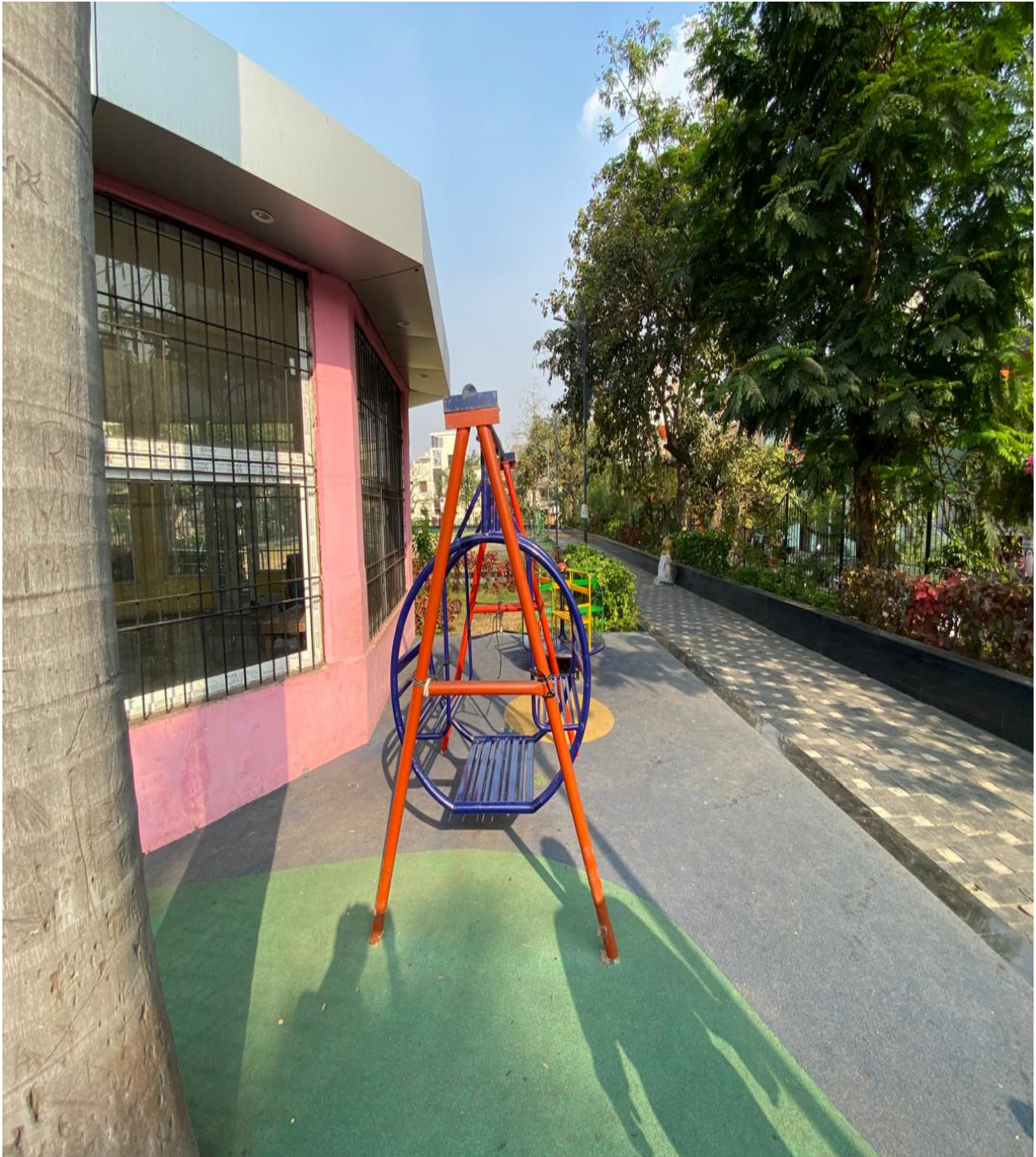
Globe Swing 4-Seater