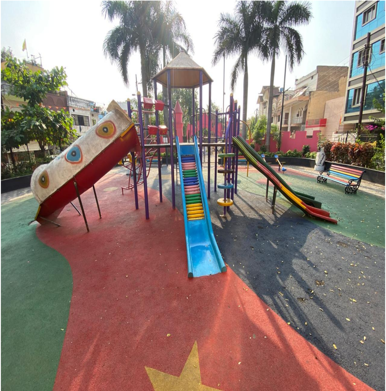
Roller Multiplay System